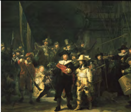
Figure 25-13 REMBRANDT VAN RIJN, The Company of Captain Frans Banning Cocq (Night Watch) , 1642. Oil on canvas (cropped from original size), 11' 11" x 14' 4". Rijksmuseum, Amsterdam.