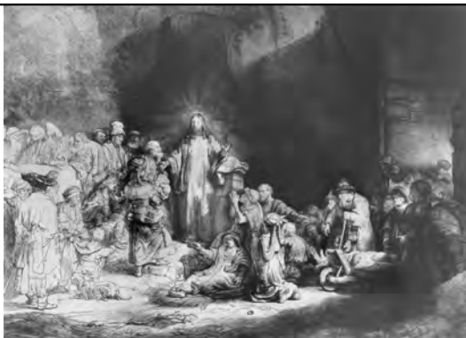
Figure 25-16 REMBRANDT VAN RIJN, Christ with the Sick around Him, Receiving the Children (Hundred Guilder Print) , ca. 1649. Etching, 11" x 1' 3 1/4". Pierpont Morgan Library, New York.