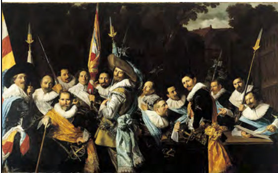
Figure 25-9 FRANS HALS, Archers of Saint Hadrian , ca. 1633. Oil on canvas, approx. 6' 9" x 11'. Frans Halsmuseum, Haarlem.