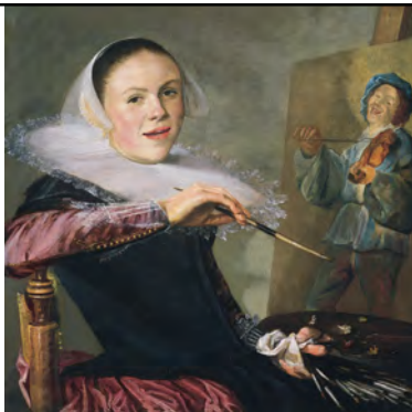
Figure 25-11 JUDITH LEYSTER, Self-Portrait , ca. 1630. Oil on canvas, 2' 5 3/8" x 2' 1 5/8". National Gallery of Art, Washington, D.C. (gift of Mr. and Mrs. Robert Woods Bliss).