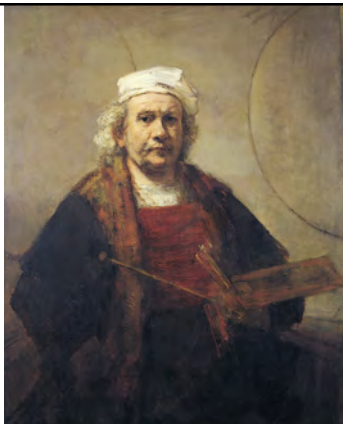
Figure 25-15 REMBRANDT VAN RIJN, Self-Portrait , ca. 1659-1660. Oil on canvas, approx. 3' 8 3/4" x 3' 1". Kenwood House, London (Iveagh Bequest).