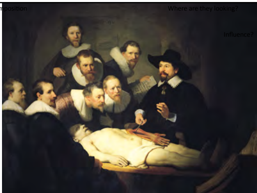
Figure 25-12 REMBRANDT VAN RIJN, Anatomy Lesson of Dr. Tulp , 1632. Oil on canvas, 5' 3 3/4" x 7' 1 1/4". Mauritshuis, The Hague.