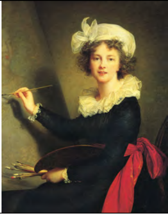
Figure 29-14 Élisabeth Louise Vigée- Lebrun, Self-Portrait, 1790. Oil on canvas, 8' 4" x 6' 9". Galleria degli Uffizi, Florence.