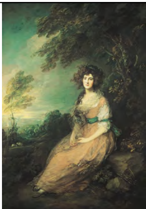
Figure 29-16 THOMAS GAINSBOROUGH, Mrs. Richard Brinsley Sheridan , 1787. Oil on canvas, 7' 2 5/8" x 5' 5/8". National Gallery of Art, Washington, D.C. (Andrew W. Mellon Collection).

Gainsborough—typically favored pastoral settings— showing off English countryside