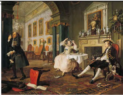
Figure 29-15 WILLIAM HOGARTH, Breakfast Scene, from Marriage à la Mode , ca. 1745. Oil on canvas, 2' 4" x 3'. National Gallery, London.

Gainsborough—typically favored pastoral settings— showing off English countryside