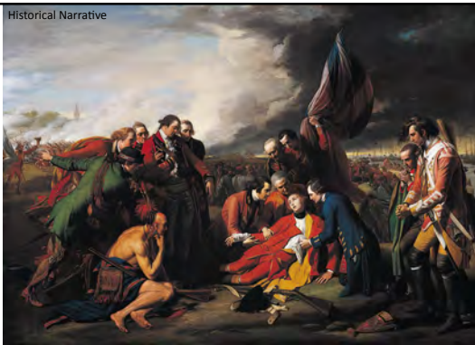
Figure 29-18 BENJAMIN WEST, Death of General Wolfe , 1771. Oil on canvas, approx. 4' 11" x 7' National Gallery of Canada, Ottawa (gift of the Duke of Westminster, 1918).