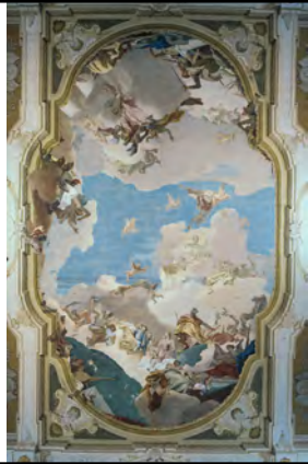
Figure 29-8 GIAMBATTISTA TIEPOLO, Apotheosis of the Pisani Family , ceiling fresco in the Villa Pisani, Stra, Italy, 1761-1762. Fresco, 77' 1" x 44' 3".