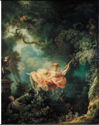
Figure 29-1 JEAN-HONORÉ FRAGONARD, The Swing , 1766. Oil on canvas, approx. 2' 8 5/8" x 2' 2". Wallace Collection, London.