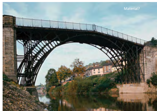
Figure 29-11 ABRAHAM DARBY III and THOMAS F. PRITCHARD, iron bridge at Coalbrookdale, England, 1776-1779.