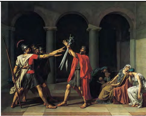
Figure 29-23 JACQUES-LOUIS DAVID, Oath of the Horatii , 1784. Oil on canvas, approx. 10' 10" x 13' 11". Louvre, Paris.