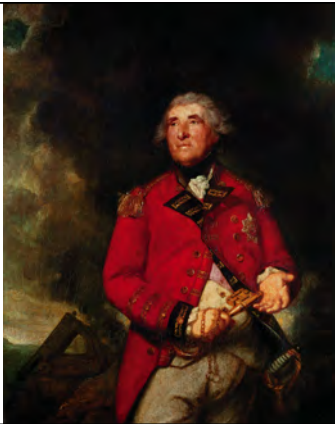
Figure 29-17 SIR JOSHUA REYNOLDS, Lord Heathfield , 1787. Oil on canvas, 4' 8" x 3' 9". National Gallery, London.

Reynolds—favored allegorical settings and references